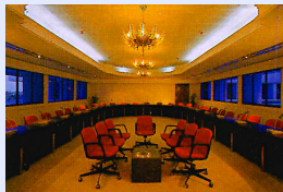
Small conference hall