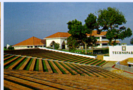
Open air auditorium