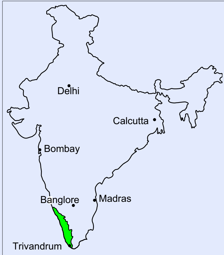
Map of India