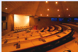
Main conference hall

A dedicated 64K line will be available throughout the conference. Full internet facilities will be available to attendees, including hands-on support.