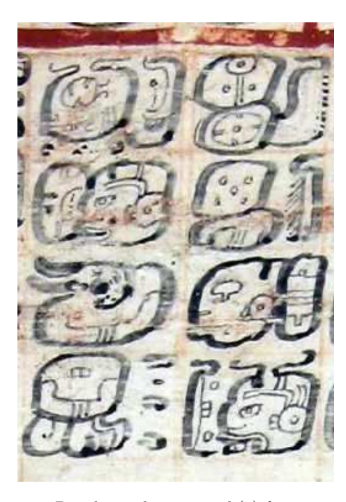
Figure 1: Dresden codex page 30b(2) & text palaeography with translation below

The writing system comprises more than 500 base signs called glyphs. Since the end of the 19th century, Western scholars set up catalogues of Maya hieroglyphics with different encoding numbers, the most popular being the Thompson Catalogue [11].