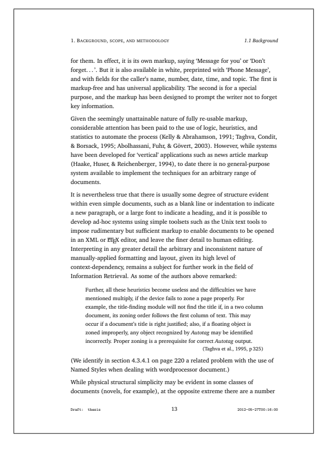
Figure 4: Default page layout for the UCC thesis